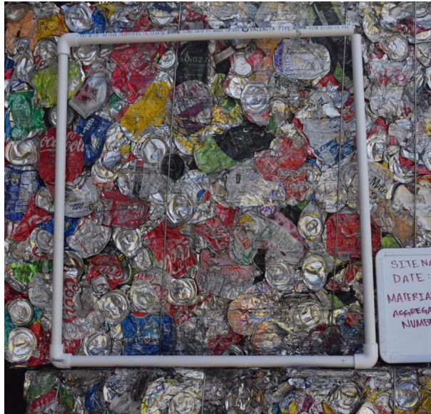
Figure 3. A quadrat boundary for visual assessment for bales and other outflows.

to the left view, and a distant straight on view showing multiple aggregates if applicable. Any noteworthy information about the outflow materials were discussed and noted with facility operators.