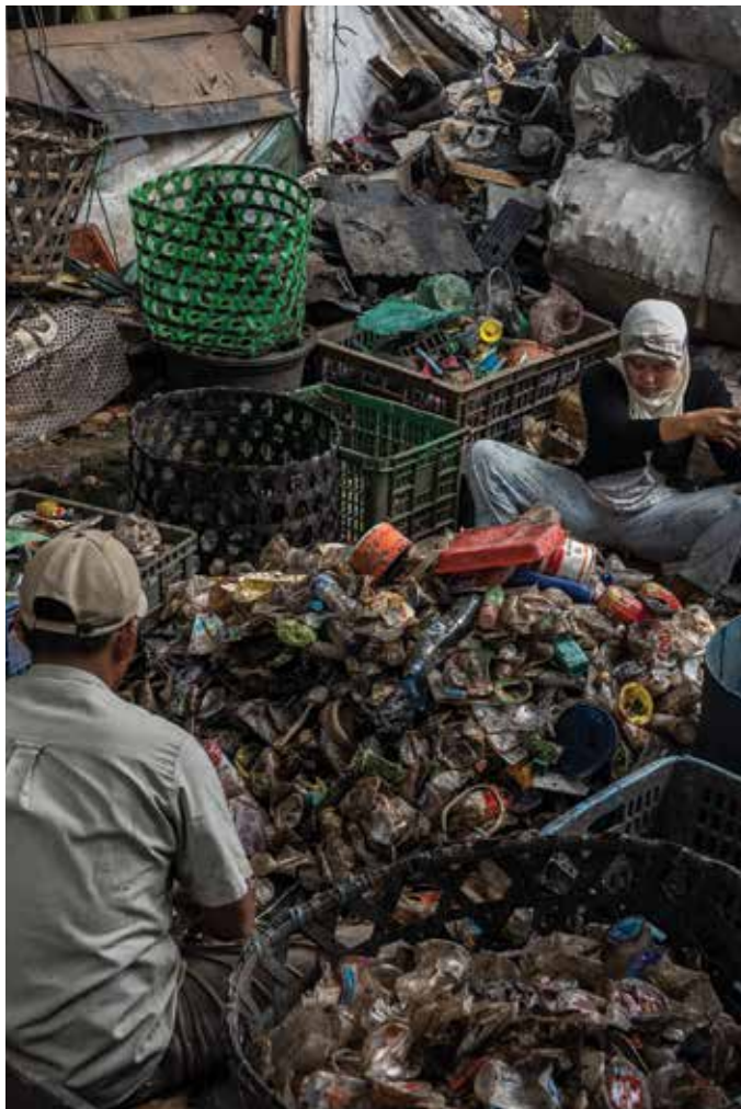
Workers recycle plastic in factories near the Bantar Gabang waste dump in Indonesia on 23 January, 2019.

Furthermore, after steep drops after the bans, data in the last quarter of 2018 suggests that imports in Malaysia, Thailand, and Taiwan are beginning to tick up again. Maintaining the bans in the absence of international regulation in the plastic waste trade requires vigilant enforcement.