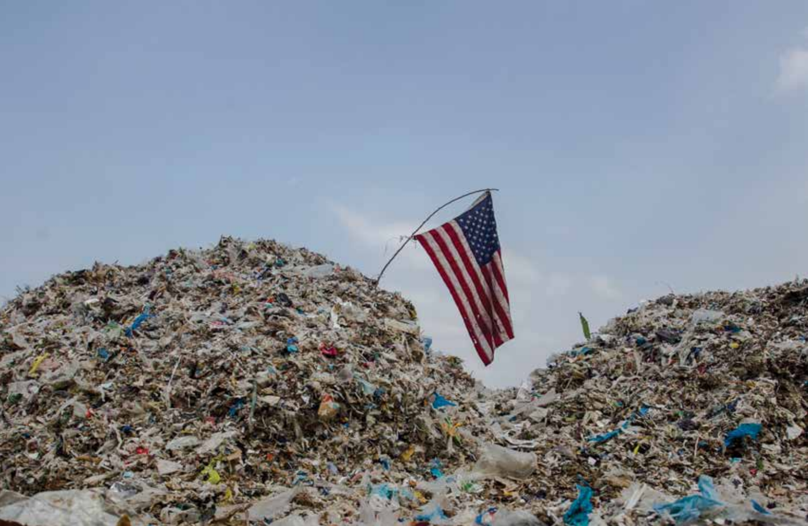
Plastic discarded by paper recycling factories piles up in Bangun, East Java, Indonesia. Ecoton, a GAIA partner organization in East Java, estimates that as much as 60–70 percent of the paper imported for recycling is contaminated with plastic waste.