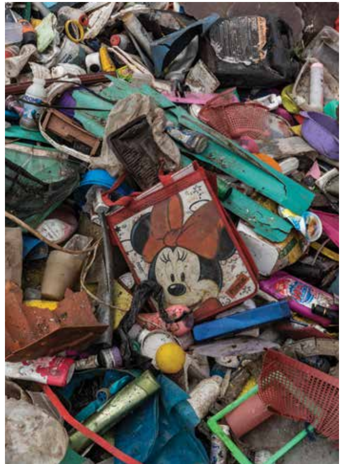
Plastic waste at the Bantar Gabang waste dump, thought to be the largest in the world, in Bantar Gabang, Indonesia on 23rd January, 2019.

"Don't push the trash out of your country. It's your trash and you know it's toxic," Charoonwong said. "Why do you dump your trash in Thailand?"