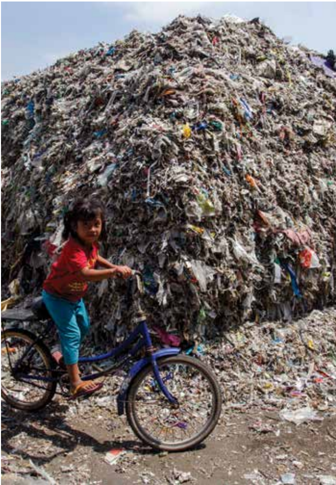
Imported plastic waste discarded from paper recycling plants piles up in villages in Bangun, East Java, Indonesia.