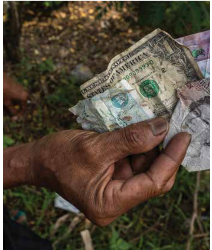
A villager in Sumengko Village in East Java, Indonesia shows foreign currency from the US, UK and New Zealand that was found in plastic contamination of paper imported by a paper recycling company. 22nd February, 2019.

Picking through the heaps of plastic scrap has become a communal cottage industry. Men and women shaded under woven conical hats crouch around the rim of a hill of shredded plastic scrap. They sift through the strips of plastic, pulling out the last bits of recyclable material: empty St. Ives lotion bottles, crushed cans of Michelob Ultra or Arizona Sweet Tea. Some damp Gatorade labels cling to dingy, clear plastic bottles. They separate thick