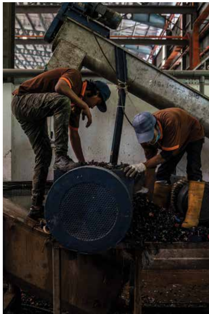
Workers recycle imported plastic in a legal plastic recycling factory in Klang, Malaysia on 23rd January, 2019.