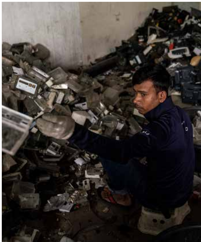
Imported plastic cases from electronic products mostly originating in USA, Canada and China are seen at an illegal recycling factory near Klang, Malaysia on 21st January, 2019.