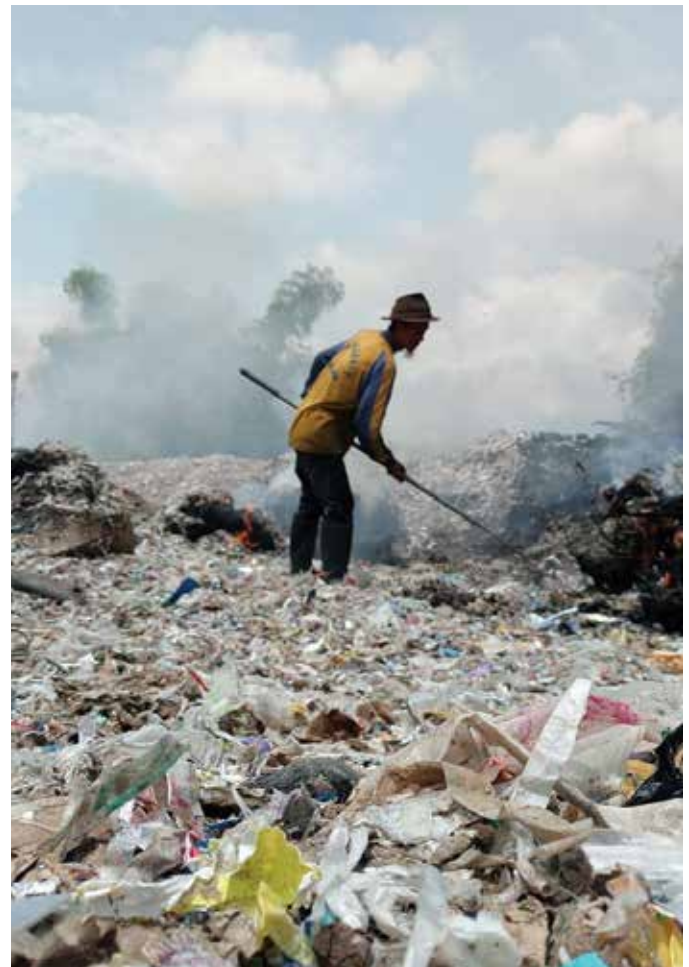
A waste picker burns imported plastic discarded from a paper recycling factory in Bangun, East Java, Indonesia. The plastic comes in bales of imported paper for recycling.

Plastic pollution had made her ill and her water undrinkable. "Don't push the trash out of your country. It's your trash and you know it's toxic," she said. "Why do you dump your trash in Thailand?"