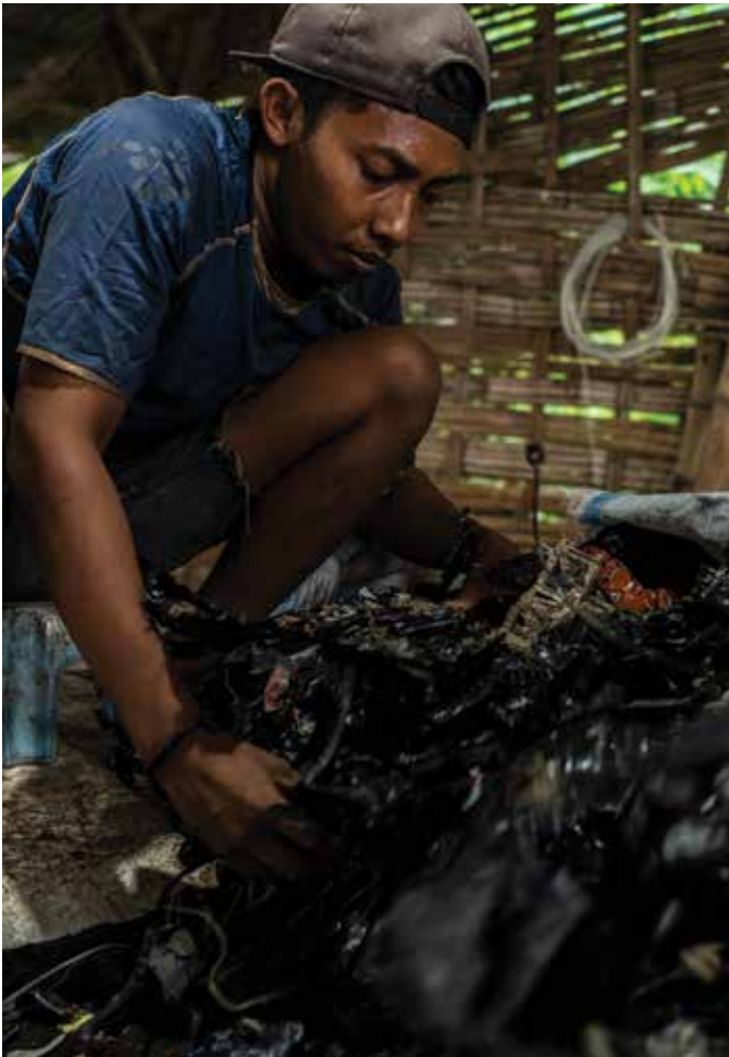
As workers makes tofu in a factory where they use cheap imported waste plastic to heat the boilers in the manufacturing process, near Gresik, Surabaya, Indonesia on 22nd February, 2019.