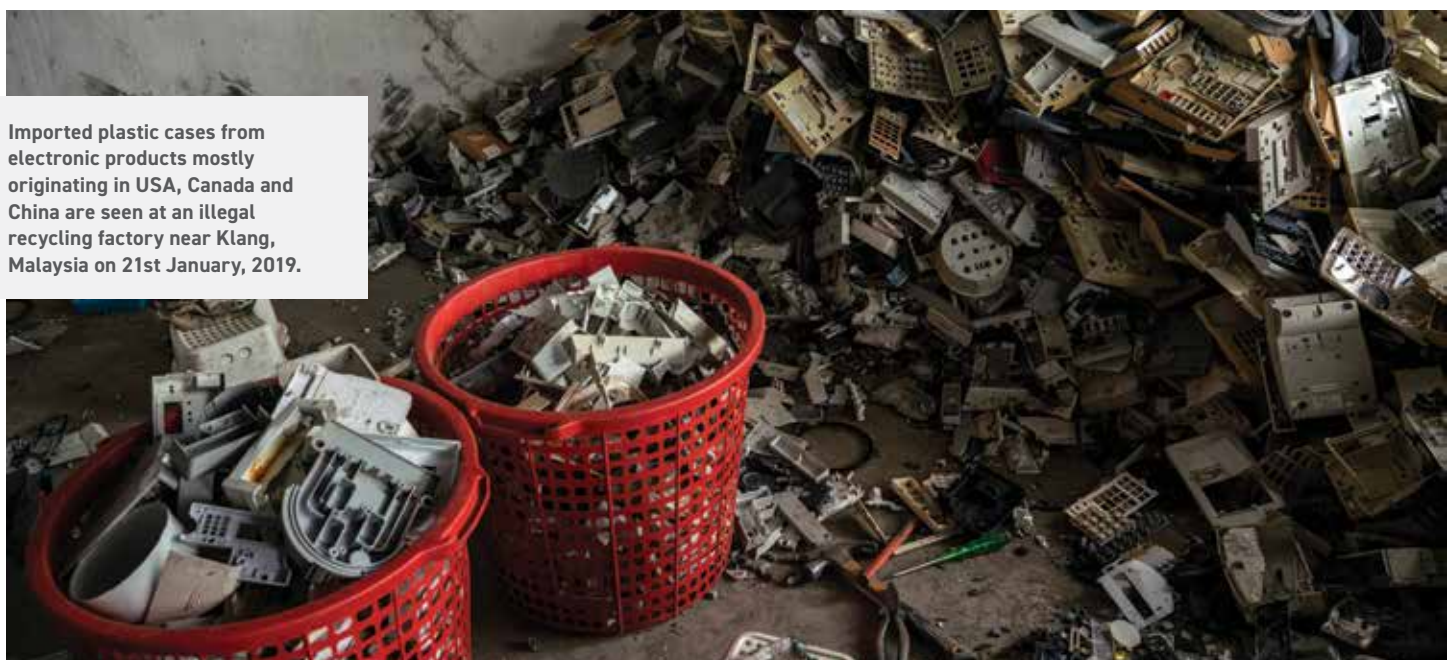
Imported plastic cases from electronic products mostly originating in USA, Canada and China are seen at an illegal recycling factory near Klang, Malaysia on 21st January, 2019.

However, a report in March by The Straits Times 38 suggests that illegal recyclers continue to find ways around the ban, moving away from the areas around Port Klang, where enforcement efforts are currently concentrated. Half an hour from Penang port, north of Klang, local reporters found an illegal plastic dump they estimated to be the size of six football fields, with plastic scrap piled two stories high. Trucks arrived with fresh loads of trash, and black smoke from open burning rose over the dump.