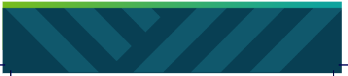
Mail-Back Insert for Inhalers