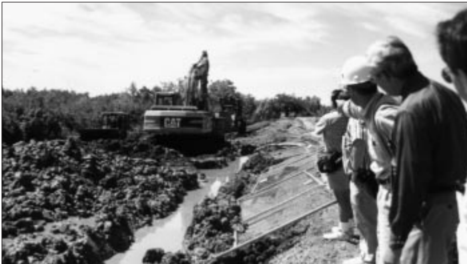
Members of the media watch as shredded waste tires are used in a levee restoration project.