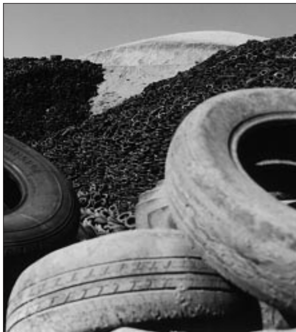
The Oxford Tire Pile in Central California is home for nearly half of the state's 15 million stockpiled waste tires.

In addition to a call for cleaning up stockpiled